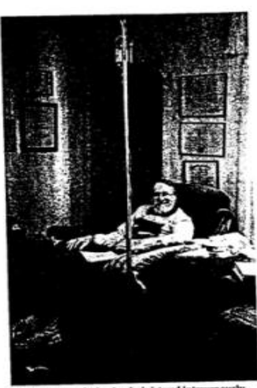
The chelation solution is administered intravenously, a painless procedure that takes 3 hours, during which patients usually read, that with each other, or nap.

Q. In your book, which came out about 10 years ago in the first edition, you attributed the resistance to chelation therapy for heart disease to the hospitals and medical profession,