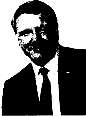
JAMES "BO" GRITZ

The Time is Now—Let's Take America Back From the "Republicrats" Who Have Brought Our Nation to the Brink of Ruin